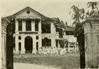
Anglo-Chinese Girls' School, Ipoh